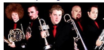
See Synergy Brass Live!

information on this excellent opportunity please visit www.connselmeru.com . Also, please share this information with your chapters. Approved scholarship recipients will be asked to submit registration and travel receipts after attendance for reimbursement. To download the Kappa Kappa Psi scholarship application please visit www.kkpsi.org .